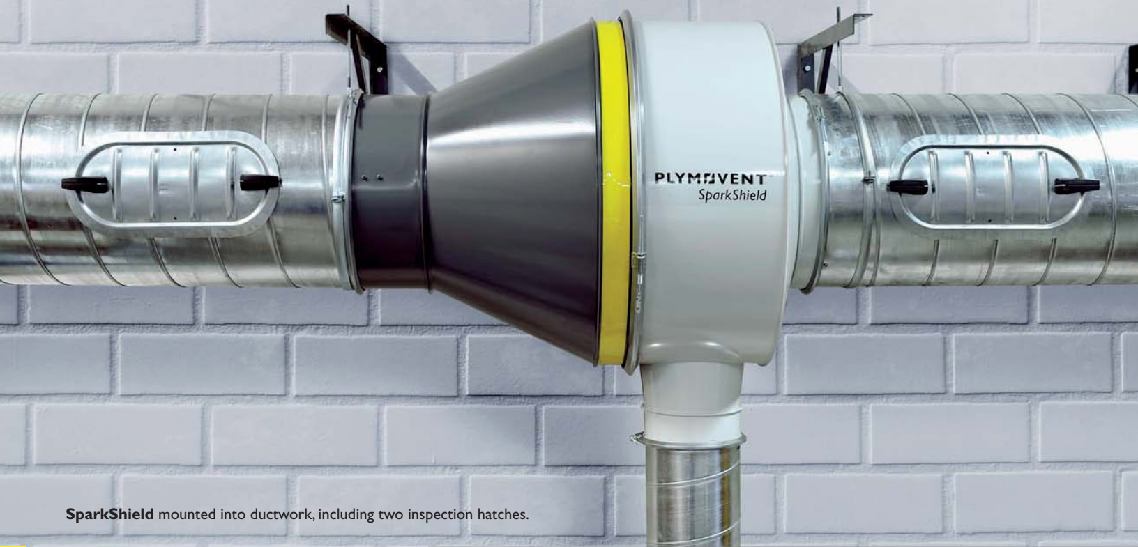
SparkShield mounted into ductwork, including two inspection hatches.