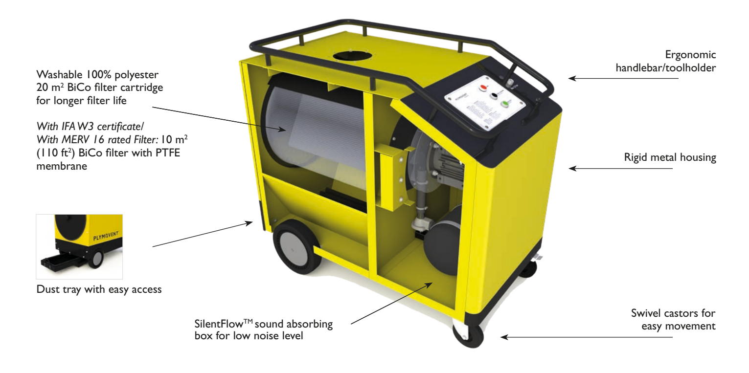
Self-cleaning Ram-Air™ pulse amplifier provides better cleaning for longer filter cartridge life and lower pressure loss