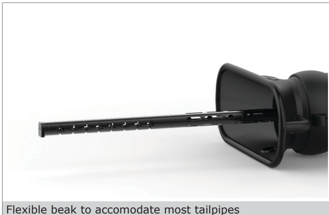
Flexible beak to accomodate most tailpipes