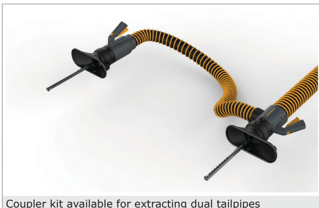
Coupler kit available for extracting dual tailpipes