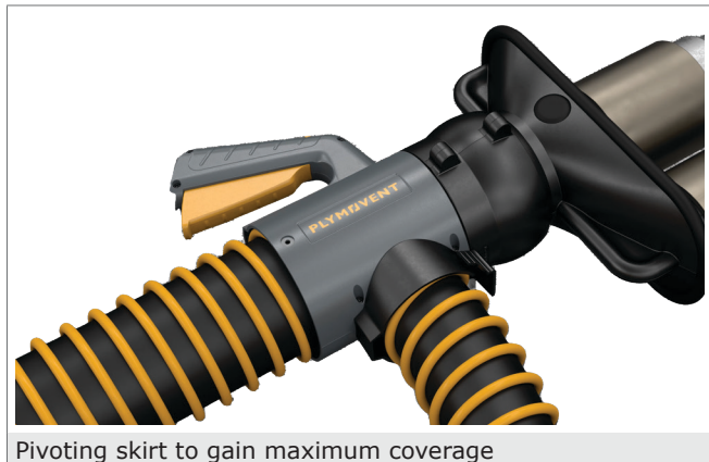
Pivoting skirt to gain maximum coverage