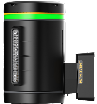
Included wall mount with tripod mount

Custom Calibration Create your own dust calibration. (Portal subscription only)