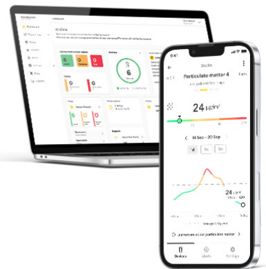
Online insights App for iOS and Android and on MyPlymovent.com