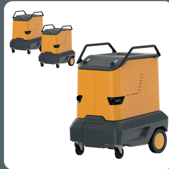
2 Ultra's in 1 PowerJet Ultra Twin