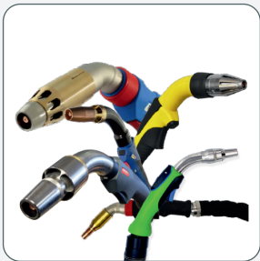
Welding torch compatible

On-torch extraction with a high-vacuum unit removes fumes directly at the welding arc, ensuring effective capture in any position without the need for repositioning. This saves time and avoids work interruptions.