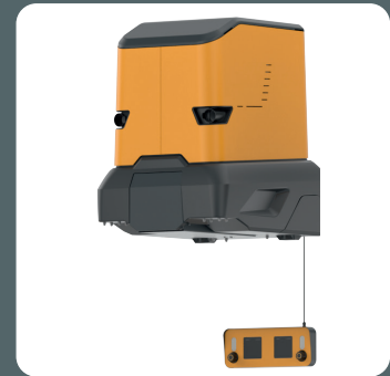
PowerJet Ultra Twin Wall