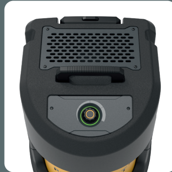
Stepless speed control & Airflow indication