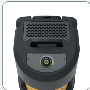
Sufficient vacuum & airflow

All our high-vacuum units are compatible with torches from leading manufacturers such as Abicor Binzel, TBI Industries, ESAB, Fronius, Lincoln Electric, Miller Electric and Trafimet.