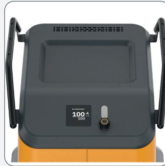
ExactFlow: The airflow can be precisely set to the exact \text{m}^3/\text{h}/\text{cfm}