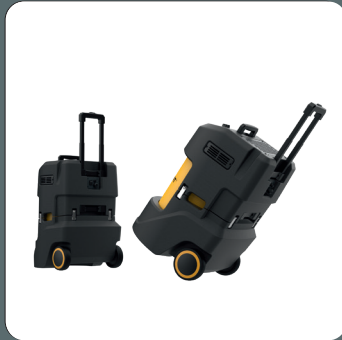
Telescopic handle for easy transport and storage

It achieves this with powerful motors, stepless speed control, and a large high-efficiency filter that lowers energy consumption and extends filter life. The automatic start-stop system improves efficiency, while the telescopic handle makes transport simple. A built-in airflow indicator monitors performance and warns of blockages so they can be resolved quickly. Fully compliant with ISO 21904 for safe, effective fume extraction.