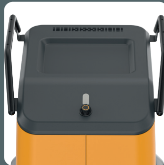
ISO-Flow: Stepless control for truly stable airflow