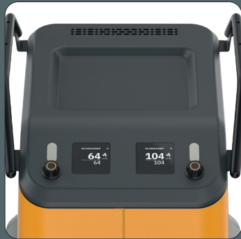
ExactFlow: fully independent airflow control per inlet

Its two 2.500 W brushless EC motors deliver a maximum vacuum of 27 kPa (108" WG) and up to 350 m 3 /h (206 cfm) airflow per inlet. ExactFlow control via individual 2.5" touchscreens lets each welder fine-tune airflow to the required m 3 /h or cfm. The PowerJet Ultra Twin includes all advanced features and safety measures found in the PowerJet Ultra, such as HyperClean filter cleaning, DustLock Technology and the AutoCheck safety system.