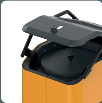
High dust load, ultra-fine filtration

This performance is powered by a state-of-the-art brushless EC motor for long service life and efficiency. ISO-Flow technology ensures stepless, constant airflow control via a push-and-twist knob, continuously monitoring and maintaining the set level in compliance with ISO 5167. A large, high-efficiency filter reduces energy use and extends filter life. AutoCheck adds safety with hose and filter detection plus a lid safety lock, while a dynamic LED bar shows the system's status at a glance. Fully compliant with ISO 21904.