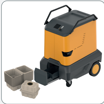
DustLock Technology: Zero dust exposure

Its ExactFlow control lets welders fine-tune airflow via a 2.5" touchscreen, maintaining the required \text{m}^3/\text{h} or \text{cfm} for optimal extraction. The HyperClean system automatically cleans the filters, preserving high filtration efficiency and extending filter life. DustLock Technology limits dust exposure with automatic drawer cleaning, a sealed disposable container, and an electronic safety lock to prevent accidental particle release. AutoCheck continuously monitors all key safety features, including compressed air levels and alerts the user when needed, ensuring safe and reliable performance.